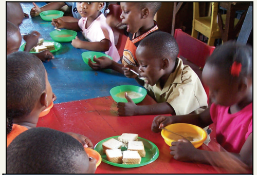
2005-2007 Breakfast St. Theresa Basic School