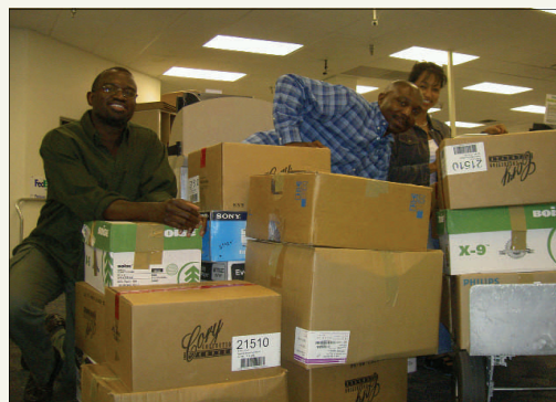
2006 Books Munro College