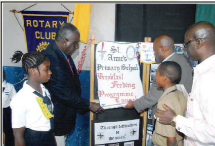
2009 Breakfast St. Anne Basic School