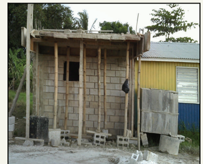
2010 Bathrooms Ebony Vale School

We've also sent school supplies, shoes and paid tuition for many.