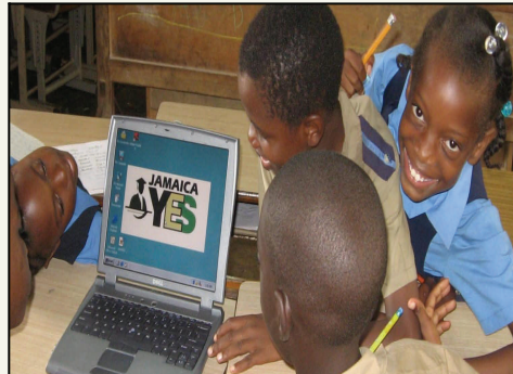
2009 Computers Pratville Primary School