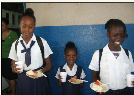
2008-2011 Breakfast Friendship Primary