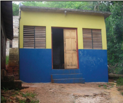
2007 Windows & door Cudjoe Hill Primary