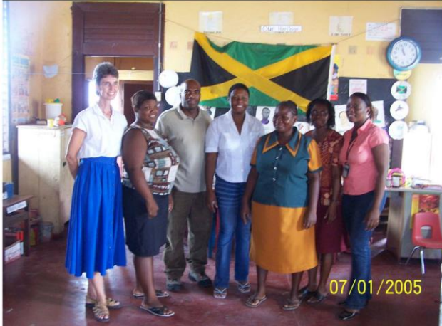
Jamaica YES representatives in 2005 visit St. Theresa School in Jamaica, one of the first school to be supported by the organization (Top)