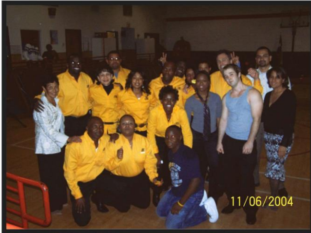
Jamaica YES fundraising event, 2004 (Top)