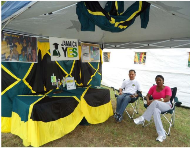
Volunteers assist with the Jamaica YES Booth at Reggae Festival, 2012 (Top)